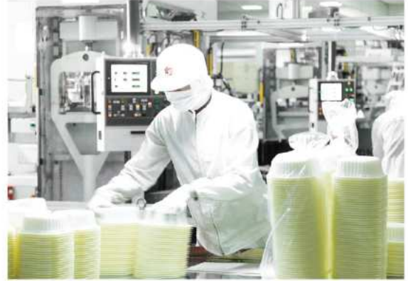
24-hour in operation