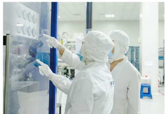
Expertise team in research & development