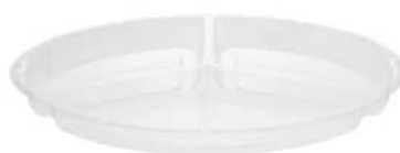
3-compartment insert for versatile applications

Thoughtful protection design around the edge to prevent cutting hand