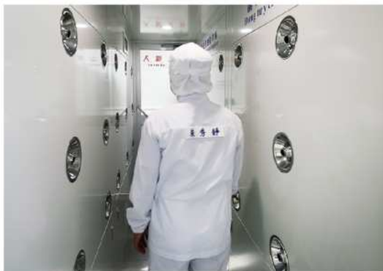
Automated production lines with air shower clean room