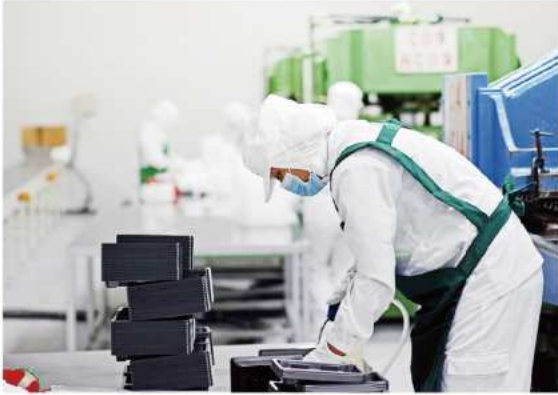
From sheet to product finishing all in-house

Certified & quality assured production processes for all of your products