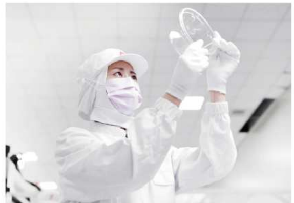
Quality control laboratory