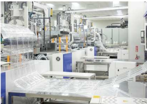
HIPS, PET, PP, UCPP sheets in-house sheeting extrusion